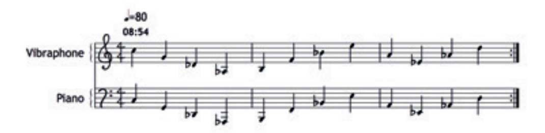
Figure 7: Transcription of Frank Spedding's serialist-inspired melody for Weave Me a Rainbow Sequence 3, Yarn Manufacture, from 08:54.

piano dissonances that flow out of the extended jazz harmonies. The rhythms alternate between 'swing' and classical 'straightness' as before. They often take on an overtly stiff and mechanical bent, changing in tempo in direct correspondence with the movement of the machines. The drum kit is featured in this section, its brush-driven rhythms often following the fast movement of the carding machines, whilst trills on woodwind and piano, along with flutter tonguing on the flute, allude to factory processes with their 'mechanical' oscillation of major and minor seconds. The final section of the sequence features the dynamism of the spinning machines with their wide arc of back and forth movement, introduced sonically by a highly dissonant strumming up and down the strings inside the piano (that sounds electronically treated towards its end).