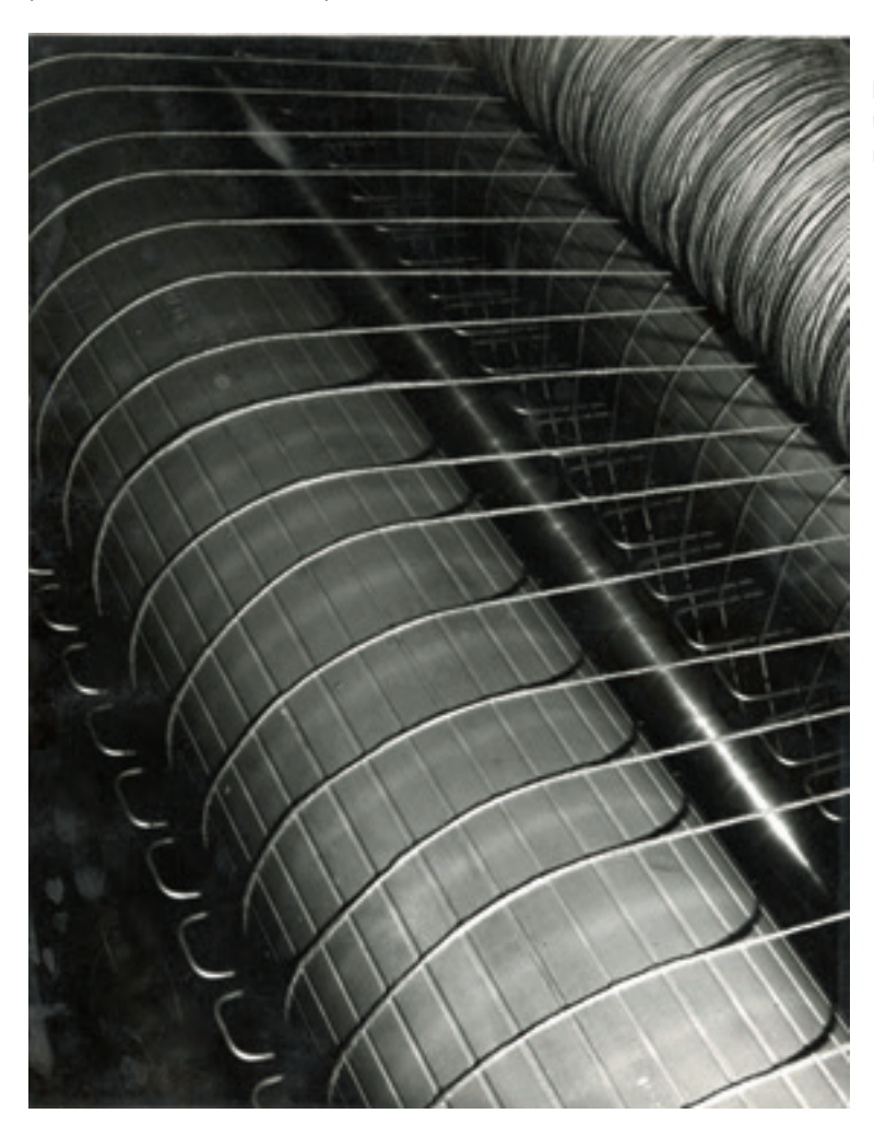
Figure 8: Production photograph of mill machinery: a twisting machine.

The latter half of the Design Sequence (from 16:16) returns to the mill but this time to concentrate on weaving. It employs similar audio-visual tactics as before though begins with a sudden brief focus on the ethereal sound and image of threads being spun off bobbins for weaving, the treatment instructing a 'plunge from a two-fold consideration of design theory into the practical workings of . . . the power loom. Make a crash entrance by reproducing in realistic sound the shock motif of the motion of the weft projectile' (Grant, 1961, p. 11). The commentary states: 'colours are chosen, patterns decided. The production of all kinds of cloth is in full swing' and what follows