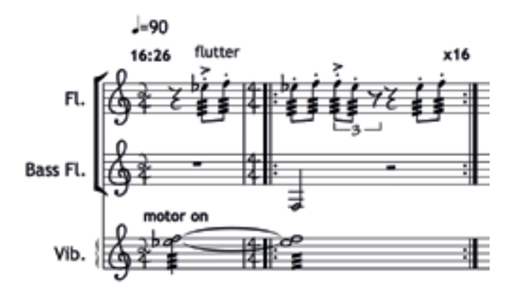
Figure 9: Transcription of Frank Spedding's music for Weave Me a Rainbow Sequence 4, Design, from 16:26.

with a syncopated and vigorous seven-bar solo drum break that almost lurches into the 'two beats to the bar' feel of this dirge-like march (from 17:52, Fig. 10), the heart of which lies in a repeated and highly pregnant dominant C7b9 chord that on its repeat closely follows a chain clicking regularly round a cog as the visual focus shifts to a loom's driver mechanism (18:12, Fig. 10, bar 10). The dissonance points to the blues and also, in its repetition, to the unfeelingly mechanical. This shift is the shooting script's instruction for a tempo change 'to an architectonic precision — warp and weft always at 90°. The march, the march of colour and pattern' (McConnell, 1961, p. 7). Spedding's faithful realization of McConnell's instruction is a highpoint of the whole film, the aesthetic pleasure generated, paramount.