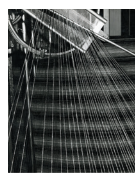
Figure 3: Production photograph of mill machinery.