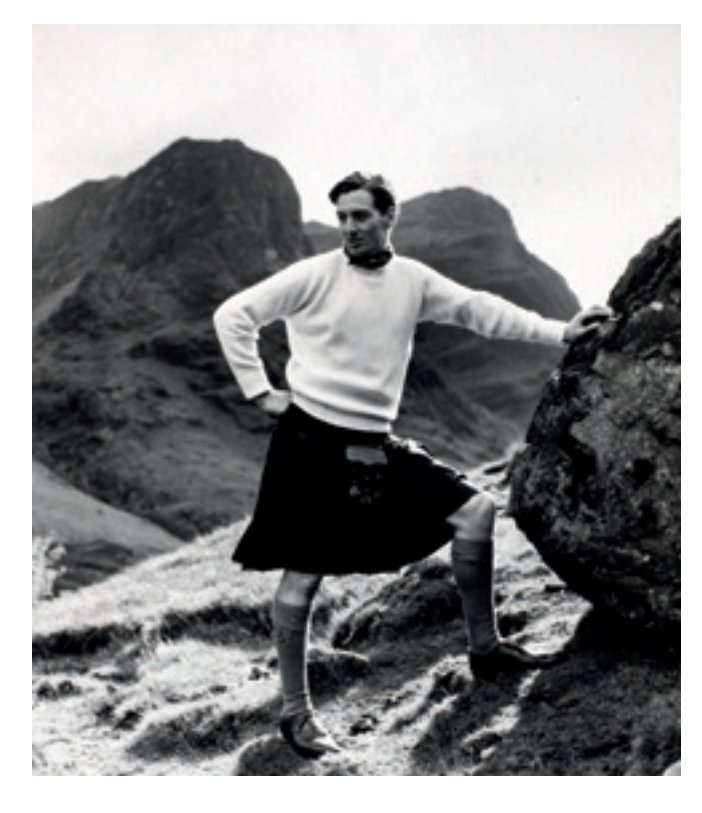
Figure 1: Elsbeth Juda's photograph from the December 1959 issue of The Ambassador Magazine .

of the International Wool Secretariat (IWS) in Ilkley, as well as in experimental prestige industrial documentaries such as Weave Me a Rainbow (McConnell, 1962), sponsored by the National Association of Scottish Woollen Manufacturers (NASWM) and the main subject of this chapter.