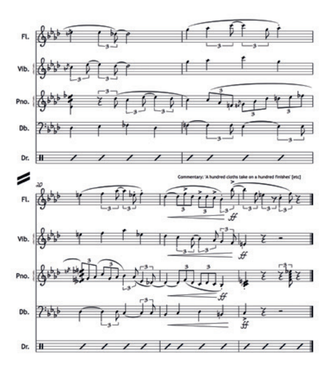
Figure 10: Transcription of Frank Spedding's blues-inflected groove for Weave Me a Rainbow Sequence 4, Design, from 17:52.