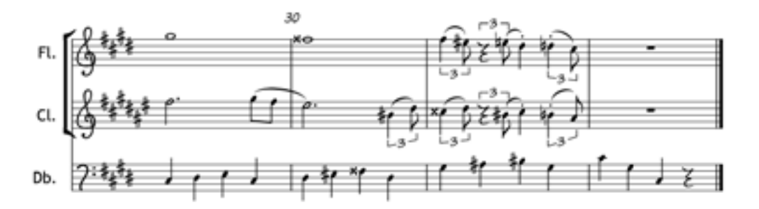
Figure 5: Author's transcription of Frank Spedding's music accompanying the title sequence of Weave Me a Rainbow. All subsequent transcriptions are my own<sup>10</sup> and all instruments always notated at concert pitch.