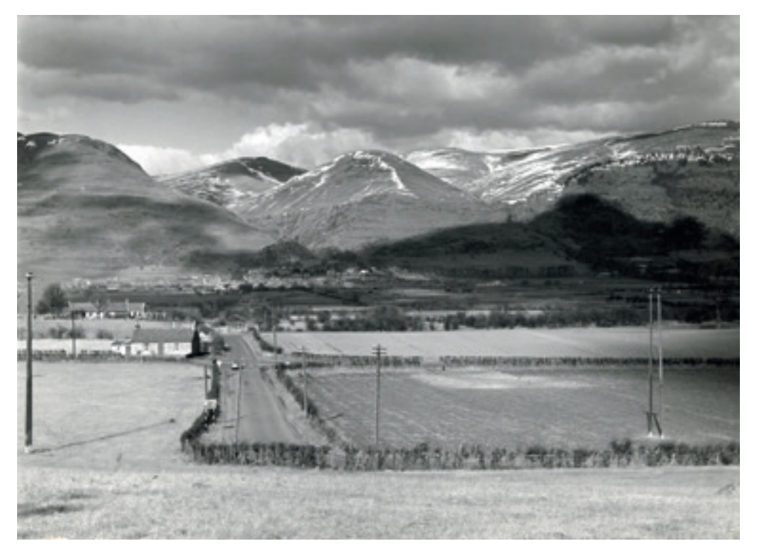
Figure 2: 'Tweed mills in the Hillfoots' (Weave Me a Rainbow production photograph). © National Library of Scotland<sup>4</sup>

to compose the score for Night Mail (Watt and Wright, 1936). The commissioning of Frank Spedding's score for Weave Me a Rainbow, only his second film score following his work on The Heart of Scotland another Films of Scotland vehicle of the same year (Henson, 2001, p. 22), was thus a typically bold move of the Committee and followed in the footsteps of lain Hamilton's work on Seawards the Great Ships. Neither composer was known for film scoring and their eclectic styles embraced both a contemporary expressive language and one steeped in musical tradition, almost the archetypical British conservative adventurers of Juda's imagination.