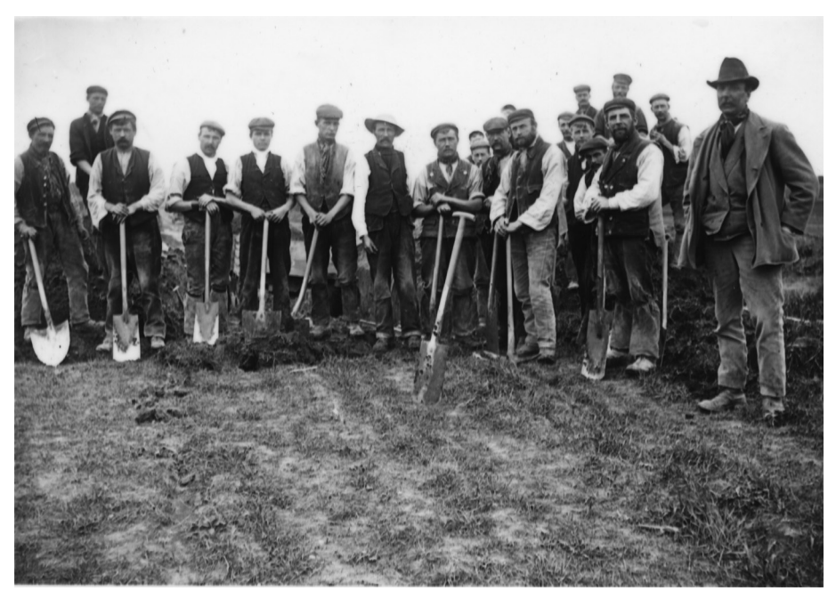
A gang of navvies near Haddenham, Buckinghamshire take time off from their work on the Great Western & Great Central Photo by S W A Newton, 1903. Reproduced with permission of the Record Office for Leicestershire, Leicester & Rutland

navvies were killed by explosions and collapsing tunnels and 'three accidental deaths per mile was considered an acceptable average'<sup>11</sup>. However, the work was well paid, particularly in comparison with the wages of an agricultural labourer, the employment that many of the navvies would have done before the days of railway construction.