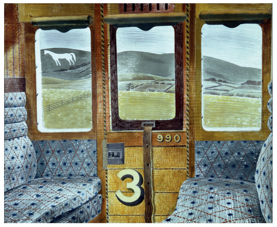
Train Landscape, Ravilious, Eric, 1903–1942

engine, to the kaleidoscopic nature of train travel, to the whirl and bustle and breathlessness of transience'.<sup>2</sup>