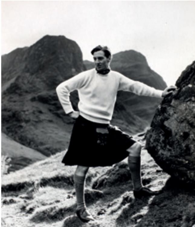
Figure 1: Elsbeth Juda's photograph from the December 1959 issue of The Ambassador Magazine .

of the International Wool Secretariat (IWS) in Ilkley, as well as in experimental prestige industrial documentaries such as Weave Me a Rainbow (McConnell, 1962), sponsored by the National Association of Scottish Woollen Manufacturers (NASWM) and the main subject of this chapter.