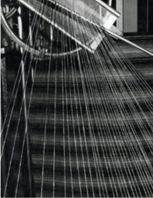
Figure 3: Production photograph of mill machinery.