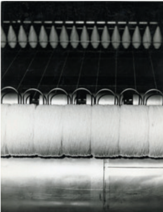
Figure 4: Production photograph of mill machinery: a twisting machine.