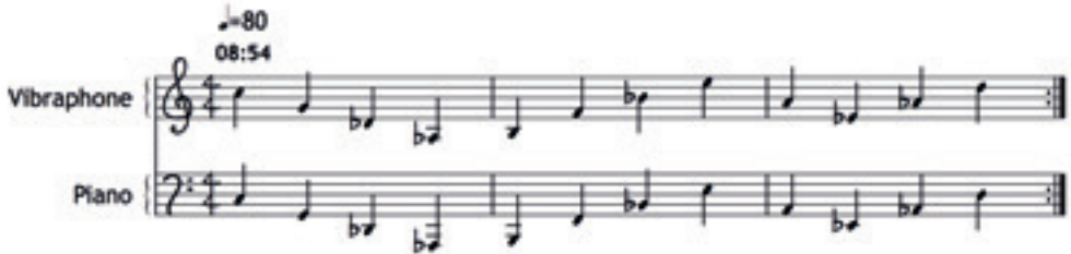
Figure 7: Transcription of Frank Spedding's serialist-inspired melody for Weave Me a Rainbow Sequence 3, Yarn Manufacture , from 08:54.

piano dissonances that flow out of the extended jazz harmonies. The rhythms alternate between 'swing' and classical 'straightness' as before. They often take on an overtly stiff and mechanical bent, changing in tempo in direct correspondence with the movement of the machines. The drum kit is featured in this section, its brush-driven rhythms often following the fast movement of the carding machines, whilst trills on woodwind and piano, along with flutter tonguing on the flute, allude to factory processes with their 'mechanical' oscillation of major and minor seconds. The final section of the sequence features the dynamism of the spinning machines with their wide arc of back and forth movement, introduced sonically by a highly dissonant strumming up and down the strings inside the piano (that sounds electronically treated towards its end).