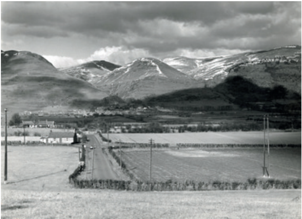
Figure 2: 'Tweed mills in the Hillfoots' ( Weave Me a Rainbow production photograph). 4

to compose the score for Night Mail (Watt and Wright, 1936). The commissioning of Frank Spedding's score for Weave Me a Rainbow , only his second film score following his work on The Heart of Scotland another Films of Scotland vehicle of the same year (Henson, 2001, p. 22), was thus a typically bold move of the Committee and followed in the footsteps of Iain Hamilton's work on Seawards the Great Ships . Neither composer was known for film scoring and their eclectic styles embraced both a contemporary expressive language and one steeped in musical tradition, almost the archetypical British conservative adventurers of Juda's imagination.