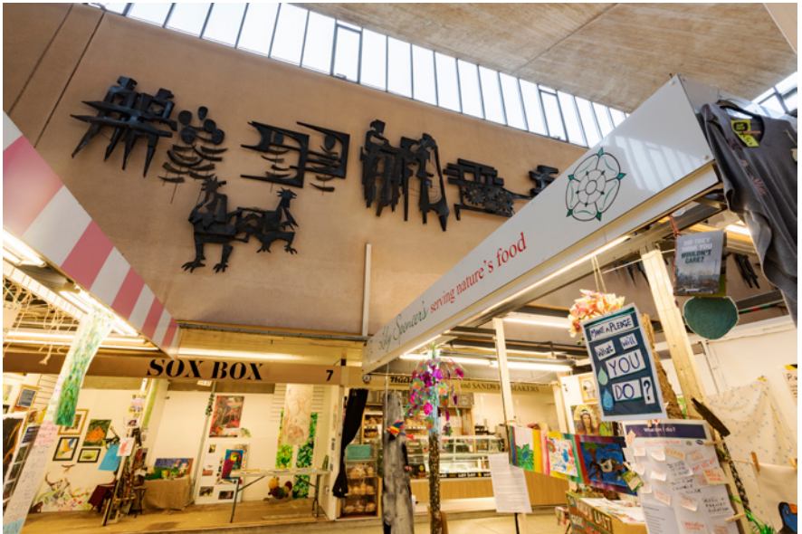
Queensgate Indoor Market, Huddersfield. Laura Mateescu, 2020.

8 Hirschhorn, T. (2009) Spectrum of Evaluation , Critical Laboratory, pp.80–81.