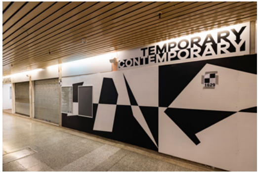
Exterior of the Market Gallery within Queensgate Market.