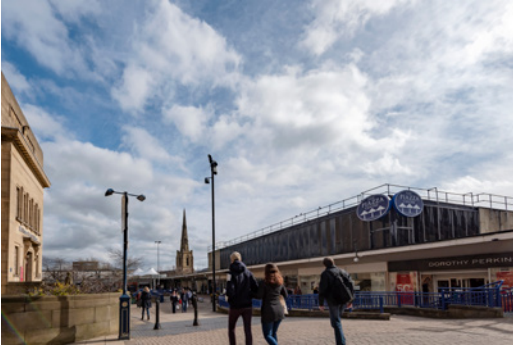
Exterior of the Piazza Shopping Centre.