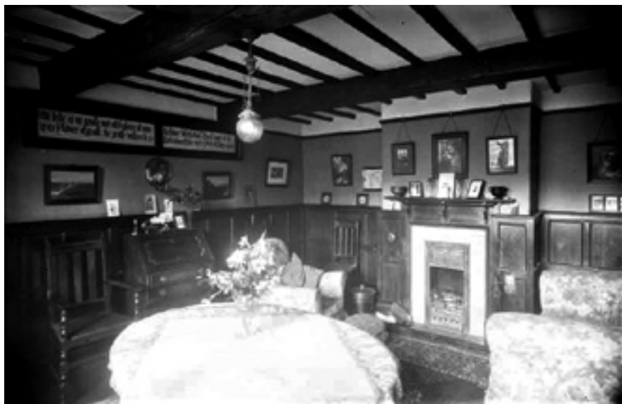
16. Longley Old Hall, interior, showing the board with the text from 1 Peter, chapter 1, 24–5.