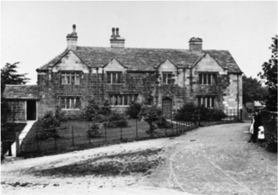
2. Longley Old Hall after restoration (1885).

(1804–1888), long-serving vicar of Almondbury and author of a history of the parish, described the hall as having been built in the Tudor style on three sides of a courtyard with the main entrance on the east side. 6 It is not clear what evidence he had for this statement and it seems more likely that he was merely describing a typical gentry house of the area in this period. On Timothy Oldfield's survey map of 1716, the hall is shown as a long, narrow building aligned north west – south east. 7 The main entrance would have been on the eastern elevation. With the ranks of the gentry growing at this time, the Ramsdens were not alone in establishing their new-found place in society through building. New gentry homes sprang up across the Pennine region. They were typically built to an 'H' or 'E' plan. Varying in size, these stone-built houses were firmly rooted in the vernacular tradition, with only superficial reference to the classical influences which inspired the prodigy houses of the Elizabethan and Stuart age. 8