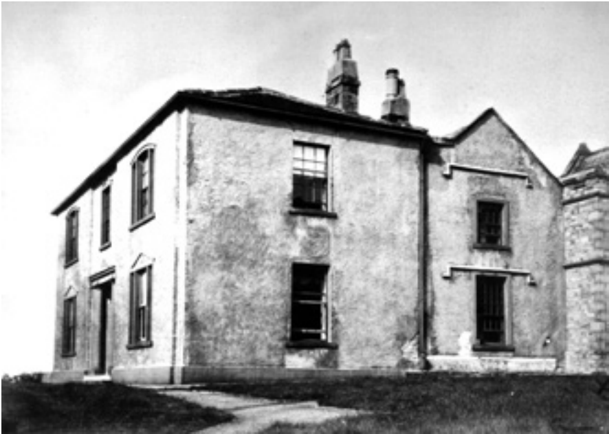
3. Longley Hall, rebuilt eighteenth-century south side, enclosing part of the original Tudor building.