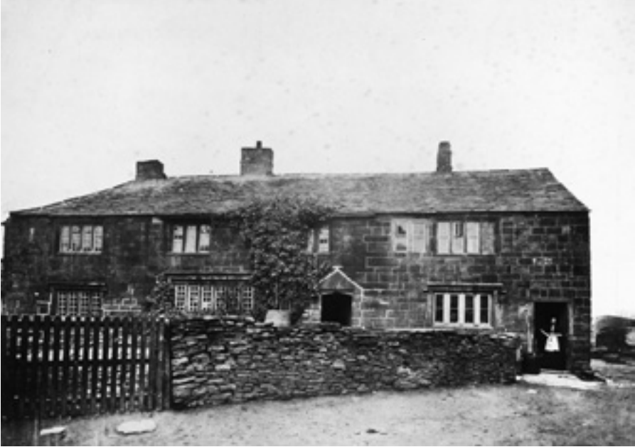
1. Longley Old Hall before restoration.