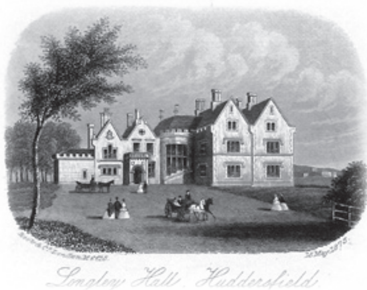
9. Longley Hall, north front. Engraving by Rock & Co. of London, 15 May 1873.

The two gables on the left formed part of the Estate Offices, designed in 1848-9 by William Wallen, enclosing the old Tudor building. The porch by W. H. Crossland was added in 1873 when the whole western side of the Hall was replaced: the ground floor rooms under the two gables to the right were the ante room and the library.