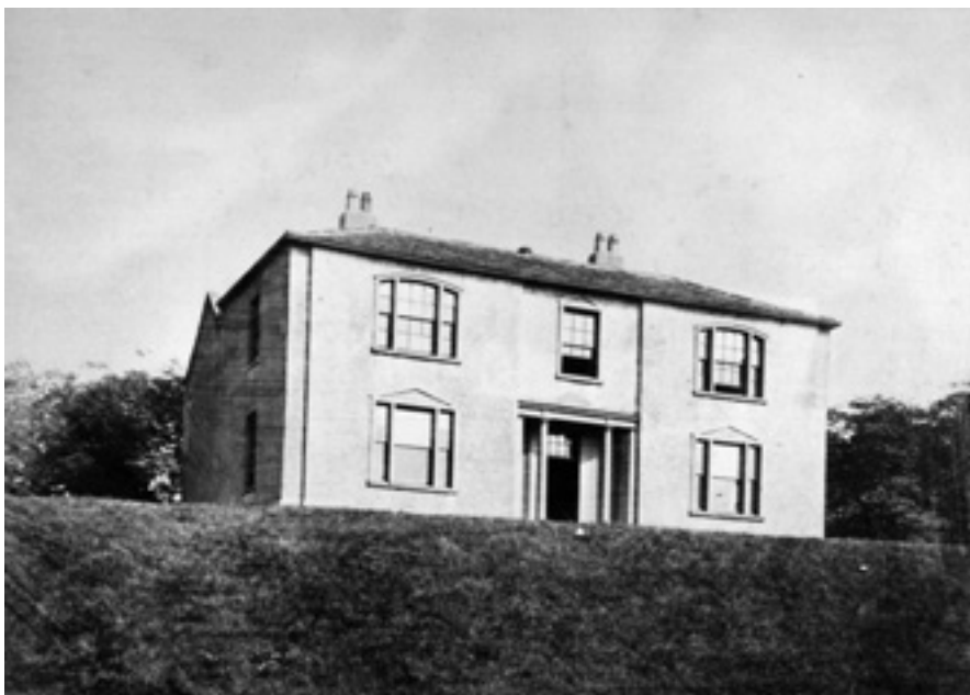
4. Longley Hall, rebuilt eighteenth-century west front. Huddersfield Local Studies Library

This new addition must have been part of a re-organisation and refurbishment of the hall, which included moving the main entrance from the east to the west elevation. The front door beneath a semi-circular light is recessed behind a pair of Tuscan columns forming a portico. Together with the treatment of the windows – tri-partite openings with simple pediments on the ground floor and arched on the first floor – suggest a date later in the 18th century. Local historian, Philp Ahier, was of the opinion that it dated from after the building of the extension to the Cloth Hall in 1780. 17 He does not give his reasons for this, though stylistically he is on good grounds. It may have been the use of brick in a predominantly stone-built area which encouraged this speculation. Brick was used for the building of the Cloth Hall and its extension, and surplus bricks from this project had been used in the construction of the New Row near the Market Place.