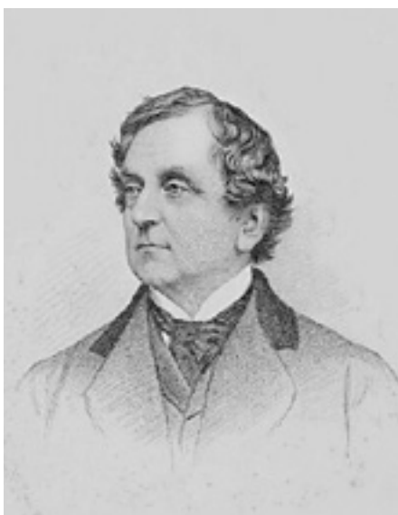
6. George Loch (1811–1877), Ramsden agent 1847–1853, by unknown artist, stipple engraving, late 19th century. National Portrait Gallery