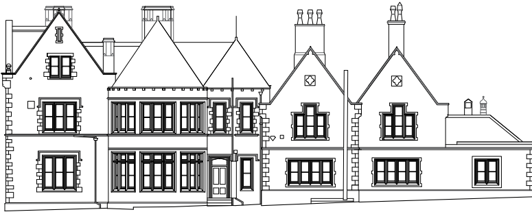
EXISTING ELEVATION C _____ Datum 90.00 A.O.D.