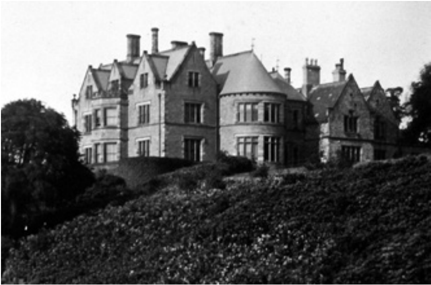
14. Longley Hall, view of the new south and west fronts from the garden (1871–3), by W. H. Crossland.