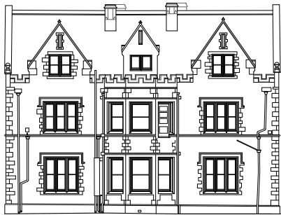
EXISTING ELEVATION D _____ Datum 90.00 A.O.D.