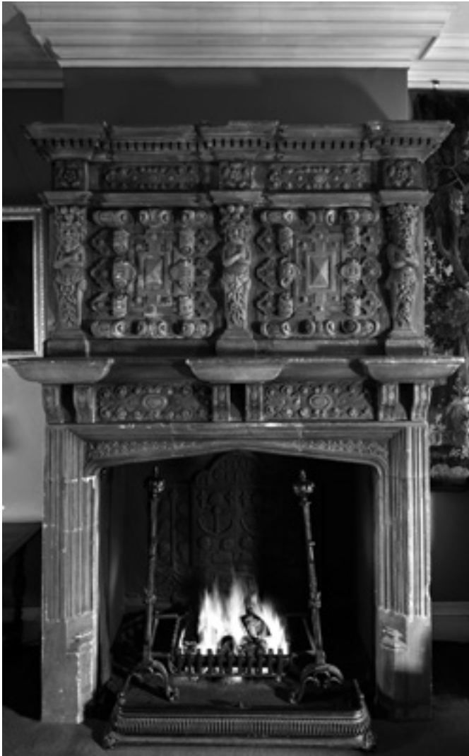
15. Tudor chimney piece, Tapestry Room, Muncaster Castle, removed from Longley New Hall, 1920.