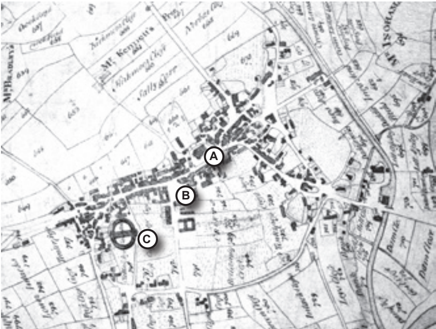
20. Ramsden estate map (1778) – town centre street map of Georgian Huddersfield.

At this time Huddersfield was virtually a one-street town extending along the line of the modern Westgate and Kirkgate. The Parish Church (A) and the Market Place (B) are central and the new Cloth Hall (C) prominent to the left.