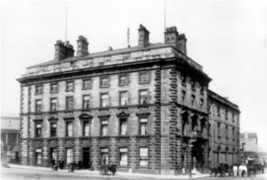
23. George Hotel (1848–1851), by William Wallen. The top floor, above the parapet, is a later addition.