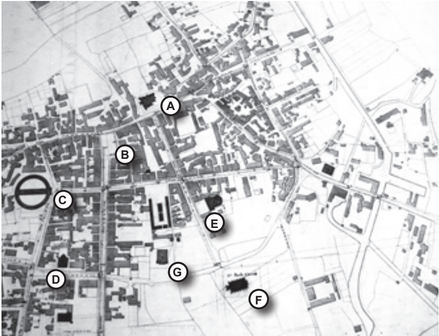
21. Thomas Dinsley map (1828) for the Waterworks Commissioners, showing the later-Georgian street pattern.

The town has now extended to the south of the original development, past the Cloth Hall (C), along Market Street to beyond High Street with its Methodist New Connexion chapel (1815) (D); from the Market Place (B) along New Street, past the Brick Buildings on the west side to beyond King Street; and from the Parish Church (A) along Cross Church Street to Queen Street, with its Wesleyan chapel (1819) (E) and thence to the isolated St Paul's church (1829) (F). Skirting the southern part of the map, Ramsden Street, with its Congregational chapel (1824) (G) is scarcely developed. The building to the north of the chapel was the Shambles.