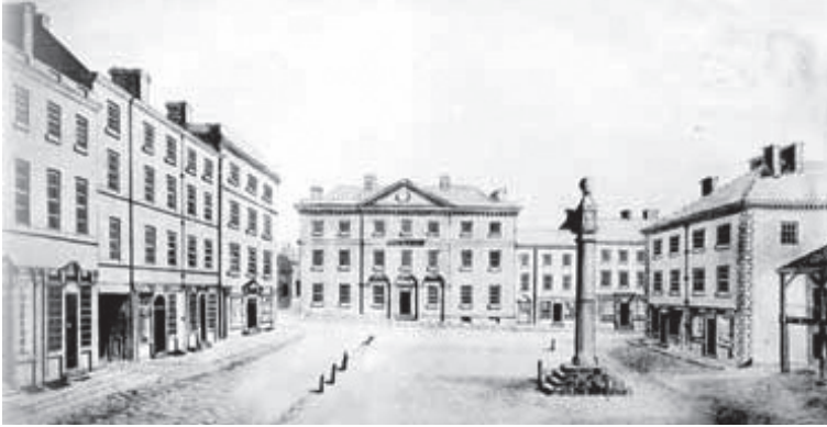
19. Market Place, looking towards Kirkgate/Westgate, with the old George Inn (centre).