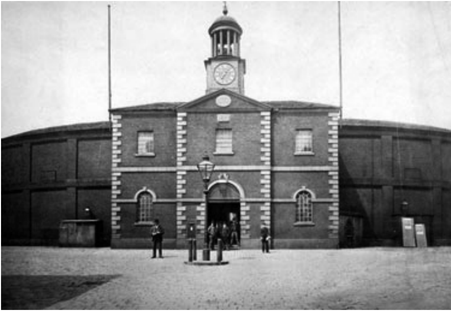
17. Cloth Hall, erected 1766 and enlarged in 1780 and 1864.