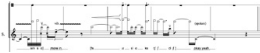
Figure 4: excerpt from Without Words , soprano part, mm. 65–69

The other intelligible words, “okay yeah,” were ad-libbed by DeBoer Bartlett during the recording session—a trace of the process of collaboration between composer and performer. This “noise” of the sampling procedure, usually edited out, is instead combined in the database on an equal footing with the more literary texts, calling to mind the information theory concept of noise as unwanted signal.