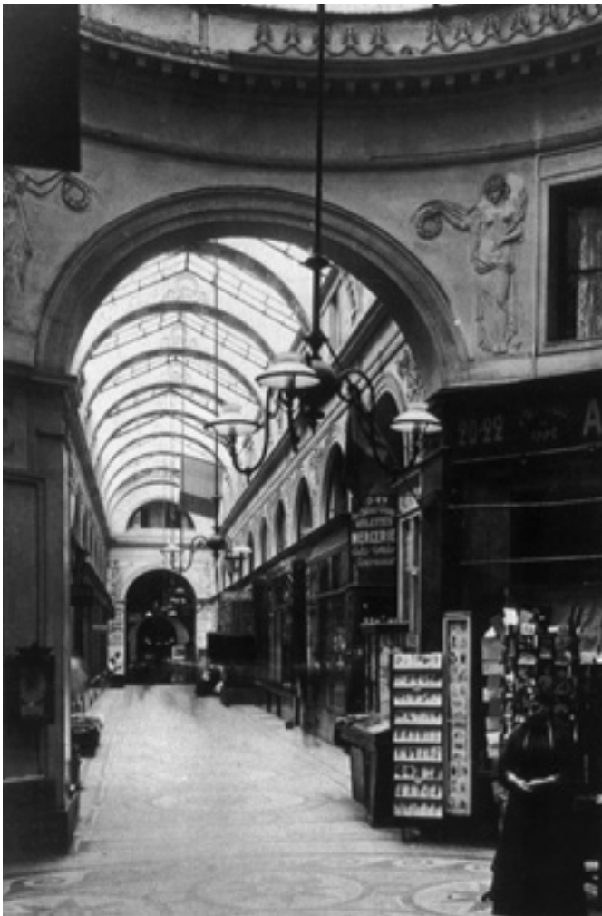
Figure 5: Galerie Vivienne, photographed in 1905 (public domain)

“improvisers” as well as over a century of time that has left some arcades filled with fashionable shops while others are repurposed or nearly abandoned. Benjamin’s Arcades Project remains unfinished, as if the strain of pre-digital copying and rearranging was too much to handle in a work that can be read as a prototype of the hyperlink.