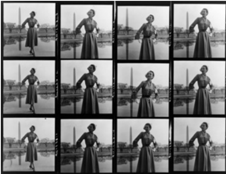
Figure 2: Toni Frissell, contact sheet, “Fashion model posing near Tidal Basin with Washington Monument in background,” 1946 23

Other serial or algorithmic techniques, like those used by Brian Ferneyhough, generate a saturation of available materials. The composer is engaged constantly as a listener evaluating, discarding, or incorporating the results, like a photographer examining images in a contact sheet to select the final print. Or in the “saturation” music of composers like Franck Bedrossian, the listener is engaged as a creator, making his or her own selection from the tangled surface.