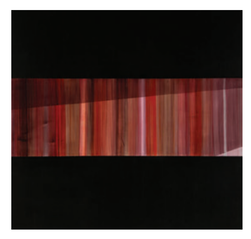
Figure 5.6 Dickens, Film Forensic series – Hikari to Kage (Light and Shadow) , 2009–10, oil on canvas, 152.5 × 152.5 cm. © Pip Dickens