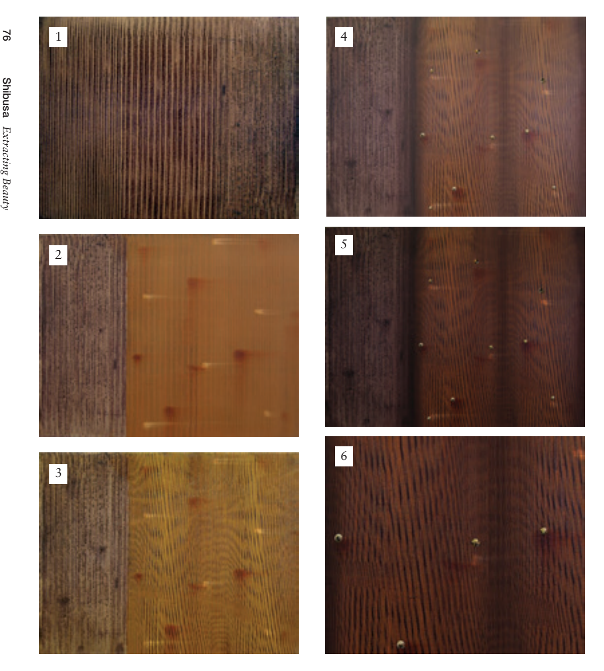
Figure 5.3 Dickens, Shibusa series - Composition #2, 2011, 51.5 × 66 cm: sequential development of the painting (left column) 1, 2 and 3, (right column) 4, 5 and detail from the finished work. © Pip Dickens

Whether, ultimately, a dysfunctional brush was used for a particular painting or not, the value was in the slowing down of time and reappraising (and appreciating) what can be done with very little. The results were forays into works whose linear qualities are extraordinarily subtle, barely perceptible (see Figures 5.2 and 5.3). Days spent slowly