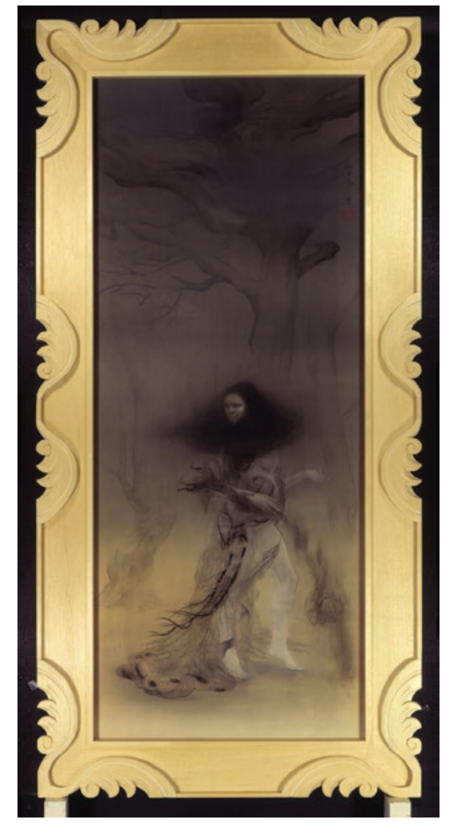
Figure 5.4 Fuyuko Matsui, Light Indentations Mingle and Run in All Directions , 2008, powdered mineral pigments on silk, 190 × 78 cm. Published by Éditions Treville, © Fuyuko Matsui