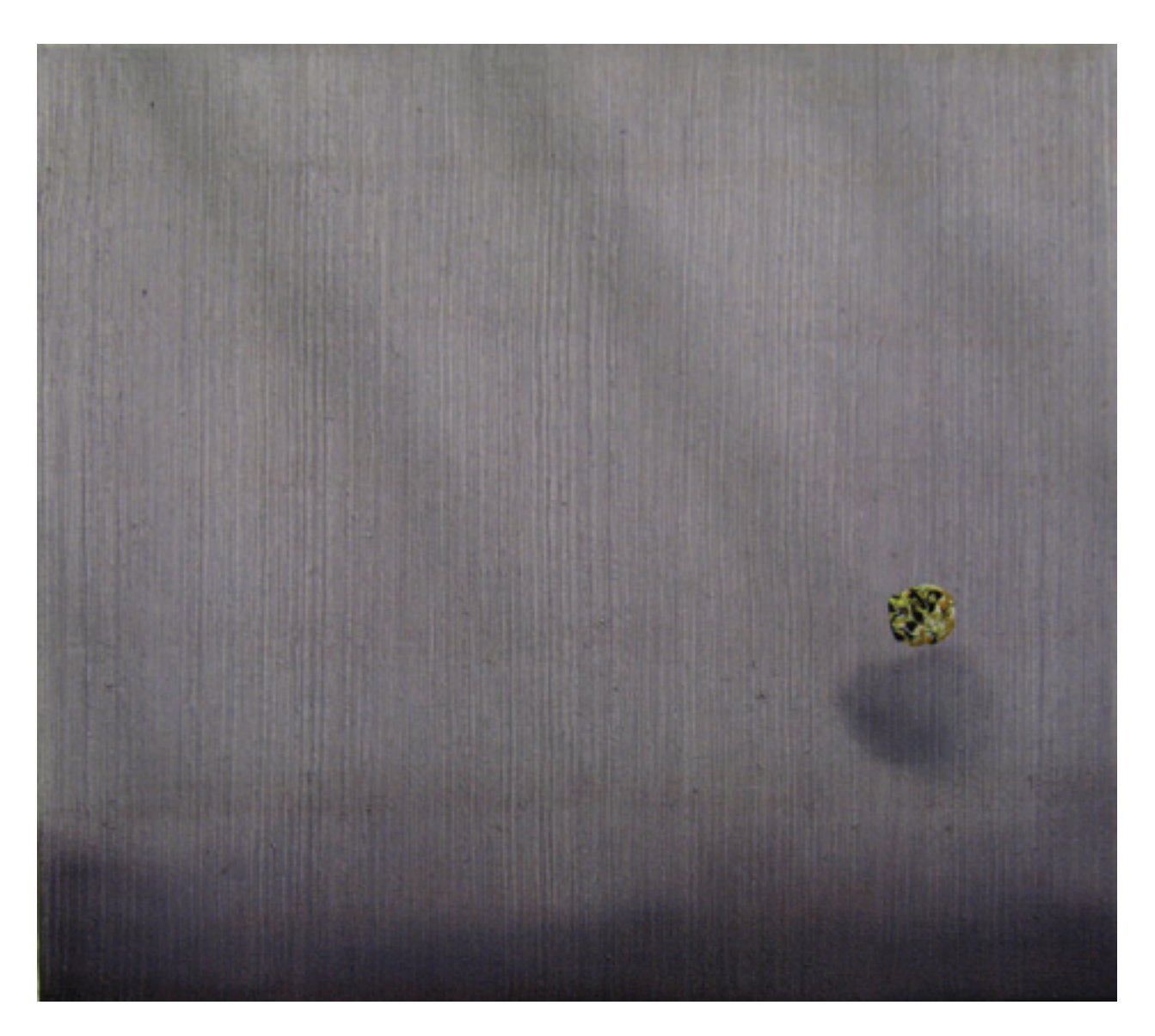
Figure 5.2 Dickens, Shibusa series – The Offing, 2011, oil on canvas, 41 \times 46 cm. @ Pip Dickens