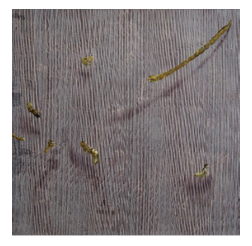
Figure 5.5 Dickens, Shibusa series – Composition #7, 2011, oil on canvas, 66.5 \times 66 cm. © Pip Dickens